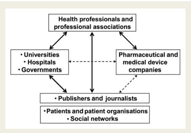
Figure I Links between providers of continuing medical education and scientific communications. Solid arrows indicate the preferred channels of communication; dotted arrows are those links where an added impartial expert commentary could be useful.

The ESC also organizes five subspeciality congresses, meetings dedicated to basic research, and clinical CME courses. Its website (escardio.org) offers educational resources such as e-learning